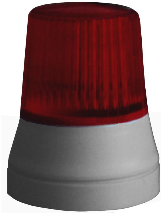
RBL 5, here: signal color red