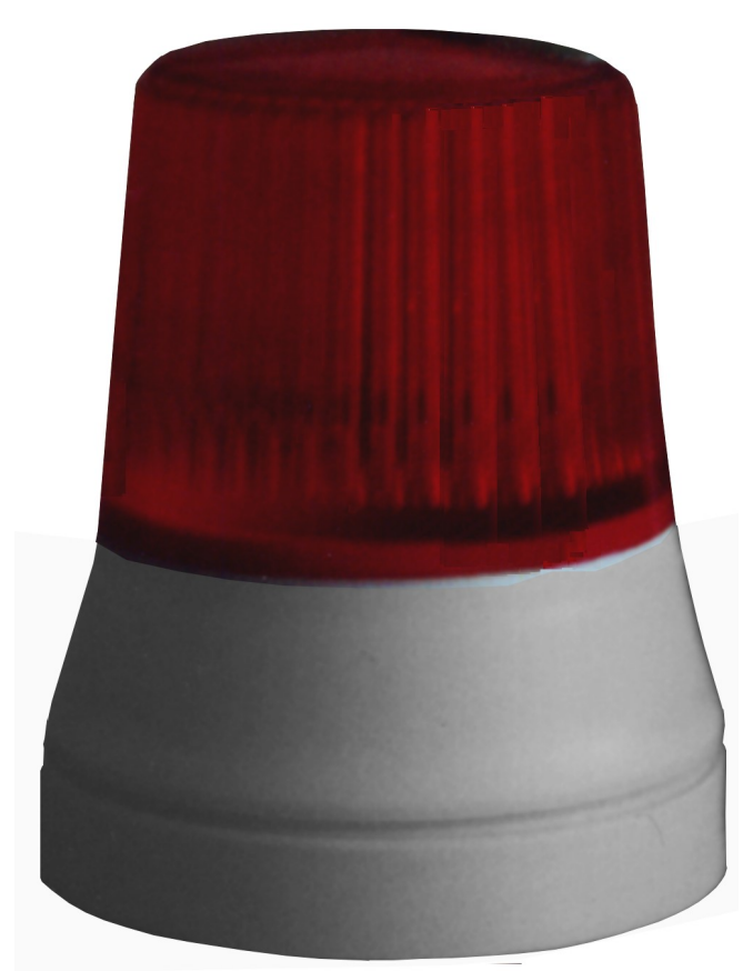
Fig.3: RLL2 with signal colour red