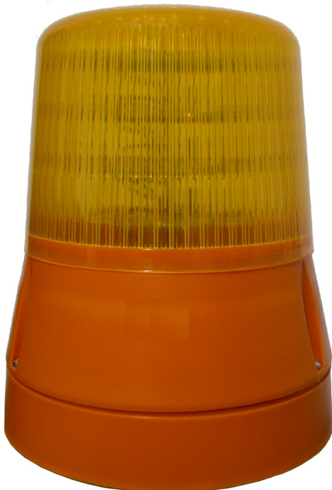
RWL 11, signal color orange