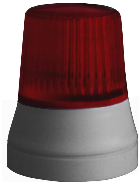
RLFW 13, here: signal color red